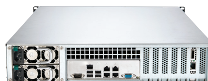
RS9-864 STORAGE VIDEO SERVER