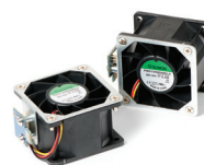
HOT-SWAP FAN MODULES